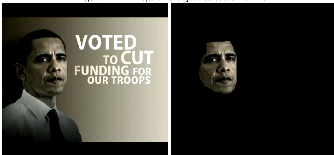
Figure 1: An image and object selected from it

When processing a large batch of images, users may find it more beneficial to go about creating these polygons in a corpus of images by utilizing the interface provided with Bio7 , a Windows and Linux development environment originally designed for ecological modeling, available at http://sourceforge.net/projects/bio7/ . Bio7 provides an excellent interface with which one can outline a polygon in an image and send the image's coordinates to R. With a little bit of scripting, a system can be set up to easily extract the coordinates